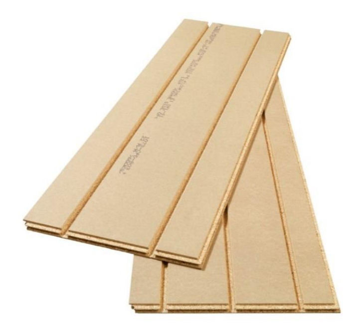
Figure 1: Kronospan/Novopan "Climate floor" particleboards.

Kronospan APS Novopan Træindustri's particleboards consist mainly of recycled timber from building demolitions and public recycling centers. All new timber that is used in production comes from certified timber from sustainable forestry. The particleboards are part of a circular system, both using leftover timber from the timber production industry, as well as recycling old particleboards back into production.